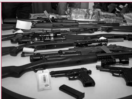
Firearms seized during the search warrants.