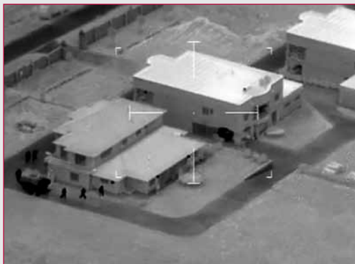
Authorities carrying out search warrants.

'Project Tricord ... epitomises a successful and innovative investigative model used to dismantle once and for all an established and highly resilient criminal network.'