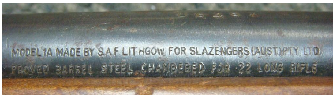
Figure 5. SAF (Slazenger) Model 1A markings

The Model 1B rifle was first produced in 1949 through to 1961 by the Lithgow SAF for Slazenger Australia Pty Ltd. This Model was an updated Model 1A. It is estimated that more than 104,000 rifles