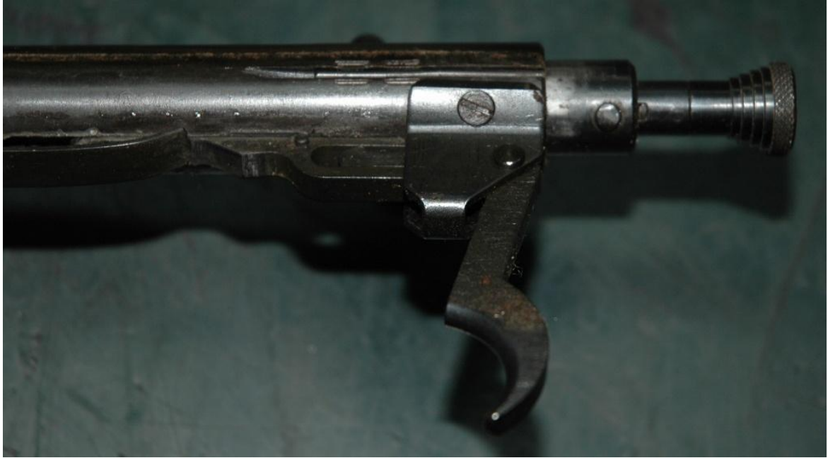
Figure 4. Lithgow SAF Model 1 markings