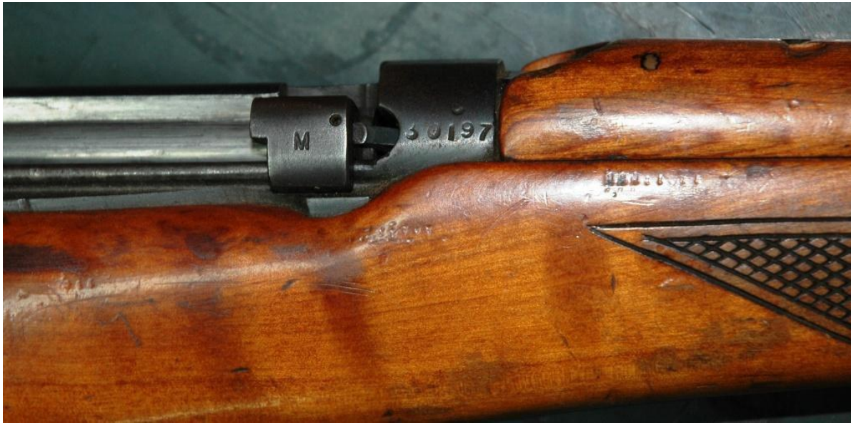
Figure 22. SAF Model 24 magazine

Figure 21. Sample Model 24 rifle is a regular Lithgow SAF SMLE No 1 MK III dated 1941 which has the correct factory serial number C30197 for this year of production (C1–C99999)