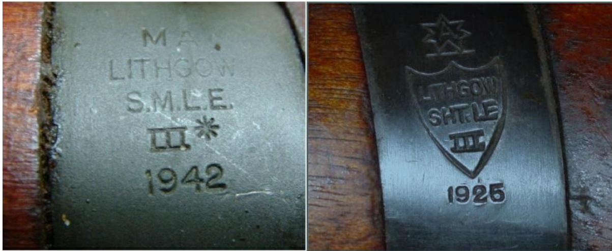
Figure 23. Lithgow Model 24 indicating both styles of factory markings and year of manufacture

The 410 conversion from military 303 SMLE No 1 MK III rifles was first introduced in 1949 and conversions ceased in 1960. These converted firearms were sold as 410 Bore bolt action single shot shotguns. Like the Model 24 conversion, these firearms will carry the full range of both SAF and other manufacture markings, including '410 SHOT' on the receiver flat. They will also have Slazenger marking on the side of the barrel, and a conversion serial number on top of the barrel. Many Australian gunsmiths also converted 303 SMLE rifles to 410 Bore, so it is difficult to identify a genuine 'Lithgow' conversion. Like the Model 24, the firearm should always be registered by the manufacturer's name of the receiver and the serial number on the receiver, and not the barrel.