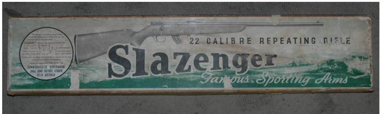
Figure 15. SAF Slazenger 55 carton markings