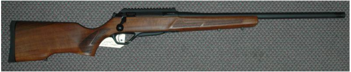
Figure 26. Lithgow Arms Model LA102 serial number structure with 16Y prefix