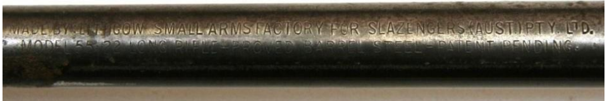
Figure 12. Lithgow SAF Slazenger Model rifle with ten round magazine