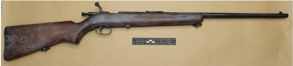
Figure 6. SAF (Slazenger) Model 1B rifle

The Model 12 22LR bolt action repeating rifle was first manufactured by Lithgow SAF in 1947 through to circa 1956 for Slazenger Australia Pty. This rifle was fitted with either a five or ten round curved detachable box magazine. The five round magazines (see Figure 8) have no manufacturer's markings, whilst the ten round magazines have the Slazenger logo and the markings 'Bibby 11 Magazine'. The serial number is on the barrel near the rear-sight (see Table 3 for serial number information).