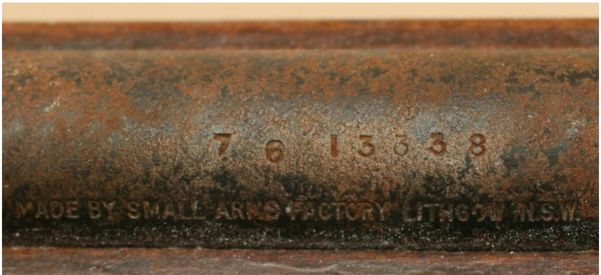
Figure 27. Lithgow SAF Model 1 serial number with 76 as a prefix