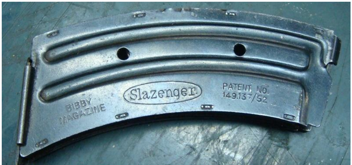
Figure 7. A Lithgow SAF manufactured ten round magazine for both the Slazenger 12 and 55

The Model 12 22LR bolt action repeating rifle was first manufactured by Lithgow SAF in 1947 through to circa 1956 for Slazenger Australia Pty. This rifle was fitted with either a five or ten round curved detachable box magazine. The five round magazines (see Figure 8) have no manufacturer's markings, whilst the ten round magazines have the Slazenger logo and the markings 'Bibby 11 Magazine'. The serial number is on the barrel near the rear-sight (see Table 3 for serial number information).