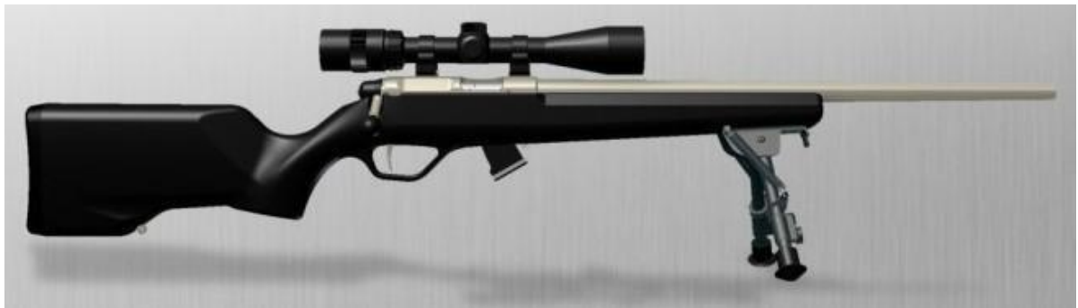
Figure 16. Lithgow Arms Model LA101 Crossover rifle

The Model LA101 Crossover 22LR bolt action repeating rifle was first offered for sale in 2014 by Thales under the name Lithgow Arms. This rifle is supplied with a five round curved detachable box magazine but will also accept both the five or ten round Czech Republic manufactured CZ-UB ZKM452 rifle magazine. The rifle is also manufactured in 17 HMR or 22 Magnum chamberings as currently advertised on the Lithgow Arms website. The serial number is located on the right-hand side forward receiver. (See Table 3 for serial number information).