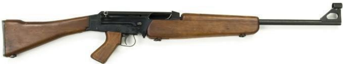
Figure 24. Lithgow SAF manufactured L1A1 Target rifle

The L1A1 Target rifle is a single shot firearm chambered for the 7.62 NATO (308 Winchester) cartridge and was designed for use in rifle competition managed by the Australian National Rifle Association. Introduced in 1968 with only 134 rifles manufactured, there are documented examples of serial numbers indicating manufacturer through to 1972.